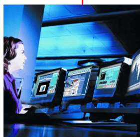
View single, or dual, video 1,000 feet away

The bi-directional serial option allows you to connect a touchscreen, digital tablet, serial printer or other supported serial device to the remote location. No set-up is needed; just connect the serial device to the serial port and it's ready to use.