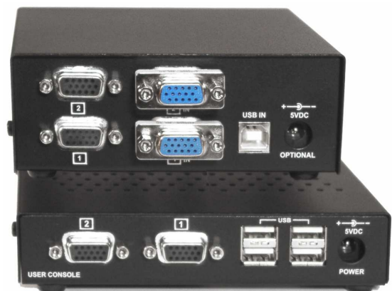
Rear view Local / Remote units Dual Video

■ Phone: 281-933-7673 ■ E-mail: sales@rose.com ■