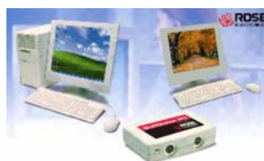
Two independent users share a single computer

In a network environment, all users have their own, unique network identities and share the common network adapter.