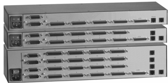
Rear view - UCR 1x4, 1x8, 1x16 (Shown with expansion cards)

■ Phone: 281-933-7673 ■ E-mail: sales@rose.com ■